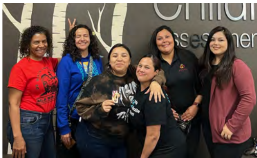
Current SPARC leaders and Advisors

Parenting CalWORKs students at Moreno Valley College are conducting their own research regarding conditions and barriers within the public assistance and higher education systems. They are designing solutions that make sense to the families living within those systems, and they are prototyping and advocating for the implementation of new ideas and out-of-the-box solutions to systems leaders and policy-makers.